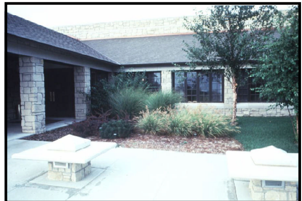
Figure 3. Well-placed grasses soften architectural lines of the building and draw attention to the entrance.

The new American style of garden design, developed over the past 30 years by Wolfgang Oehme and James van Sweden, makes generous use of ornamental grasses. The grasses are showcased as specimen plants in the perennial or shrub border, or, for a dramatic effect, in large groupings or mass plantings. Their designs abandon the English cottage garden in favor of the limitless prairie concept. In these gardens, grasses of many sizes are blended to form a sea of drifting grasses. The shorter ornamental grasses are used to edge beds. Mid-size grasses are added for vertical lines and to blend textures. The taller grasses are used to provide the structure or backbone for the beds.