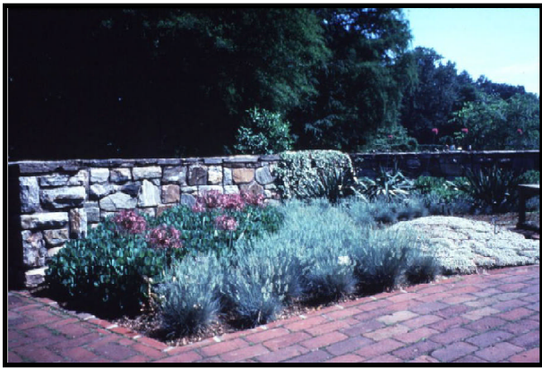
Figure 1. Ornamental blue fescue in mixed perennial border.

Ornamental grasses add texture, contrast, color and year-round interest to the landscape. Just like other groups of landscape plants, ornamental grasses are a diverse group that expand the plant palette of designers. They come in a range of sizes from the dwarf hakone grass to the giant ravenna grass. There are golden or white variegated cultivars. Some provide shades of silver and blue. Others are tinged red. Grasses that emerge late in the spring can fill voids left by spring-flowering bulbs and early spring perennials. The seed-heads or plumes of late-season grasses add ornamental value that persists into the winter. Most are suited to full sun; some handle shade. Some grasses can be easily integrated into bog or water gardens; others handle the heat and drought of mid-summer. Some spread vigorously; others form neat clumps. As a group, they tend to be free of disease and insect pests.