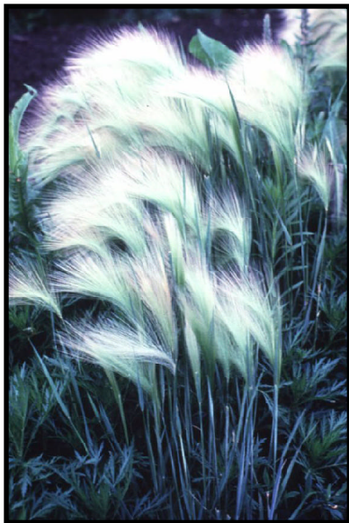
Figure 2. Decorative seed-head of the annual squirrel-tail barley, Hordeum jubatum .

Cool-season grasses start growing in late winter or early spring and flower in the spring to early summer. Some, such as Calamagrostis cultivars, may go into a decline at the onset of high summer temperatures and remain dormant until early spring when growth resumes. Others, such as Phalaris cultivars, may resume active growth in the cool weather of autumn and may retain good color in the winter. Cool-season ornamental grasses can be planted, transplanted and divided just about any time except during the heat of summer.